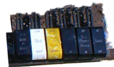
Pipe Organ Manometers

Source: Northeast Waste Management Officials' Association (NEWMOA)